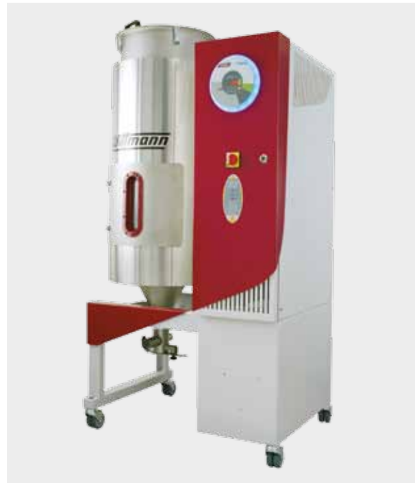
W818 linear robot (left) and the new DRYMAX Aton Primus wheel dryer.

of the rigid ejection axle. Through target reinforcement of the drives, a load of 6 kg can now be reliably handled, opening up additional possibilities for its use. But the new drive packages do not just allow a significant increase in the payload of the robots, but also allow for the implementation of an absolute value measurement system that is leading to shorter start-up times as well as simplifying the interaction of robots and other periphery.