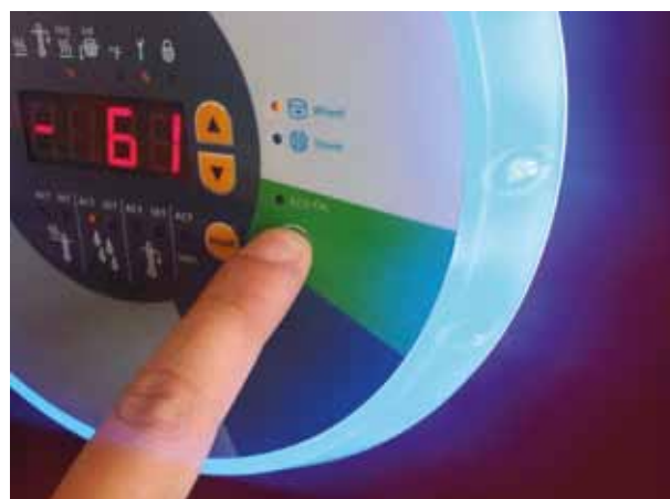
View of the R8.2 QuickEdit function screen (left). Picture right: ambiLED is showing the dryer's status – the blue color is indicating that the unit is operating in the wheel mode.