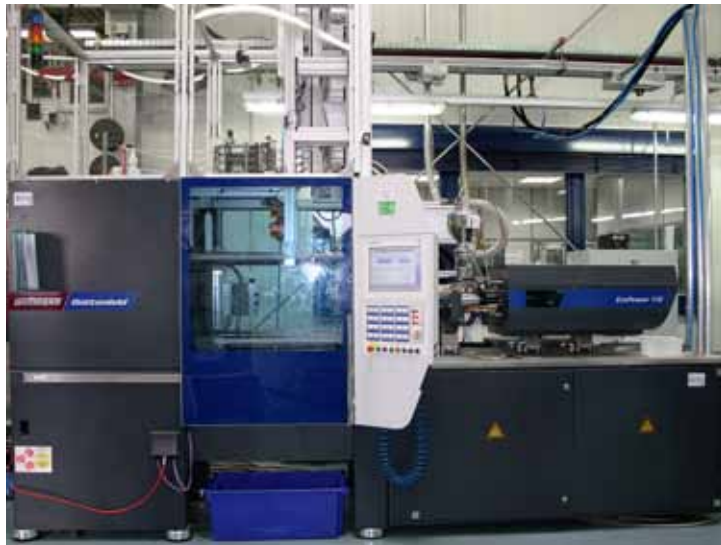
Vertical rotary table machine: flexible, precise and modular

What Stephan Wepler values most in WITTMANN BATTENFELD is their close collaboration in the development of project solutions and the readiness to react to very specific wishes. “The intensive collaboration with WITTMANN BATTENFELD in the development of the electric rotary table machine was the determining factor ensuring that, with this machine, we today possess a system tuned to the last detail to our needs.” Last, but not least, he has a special word of praise for the quality of service.