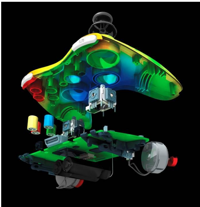
Fig. 2: Moldflow simulation