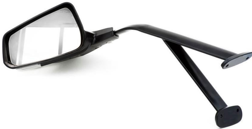
Fig. 5: Side mirror for the KTM X-Bow – product development and mold making took place at RT-CAD