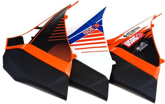
Fig. 3a + b: Cladding components for KTM motor cycles with IML technology