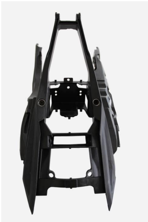
Fig. 4: The tail bracket for the KTM motorcycle is an example of substituting plastic for metal