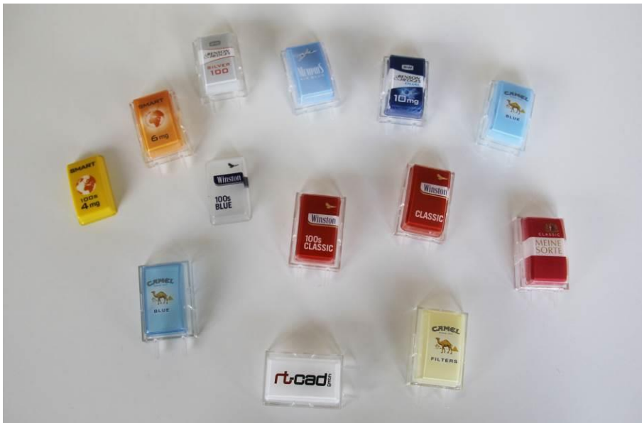
Fig. 6: Customers are to be prompted to purchase private brands of Austria Tabakwerke by attractively designed pushbuttons on the cigarette vending machines.