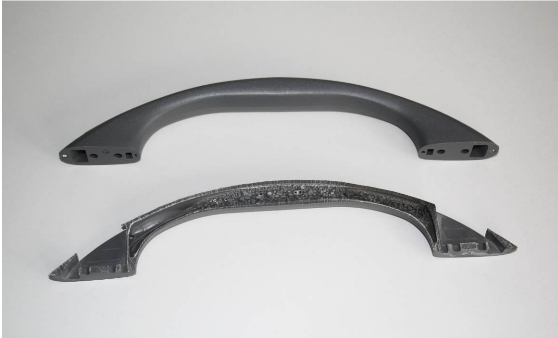
Fig. 5: Handle with internal cavity – produced with the AIRMOULD® internal gas pressure process from WITTMANN BATTENFELD