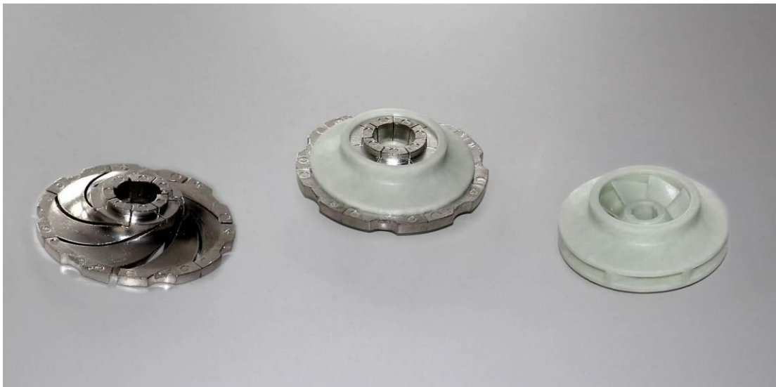
Fig. 4: Impeller wheel – manufactured with lost core technology from the left: metal core, insert-molded plastic, finished impeller wheel