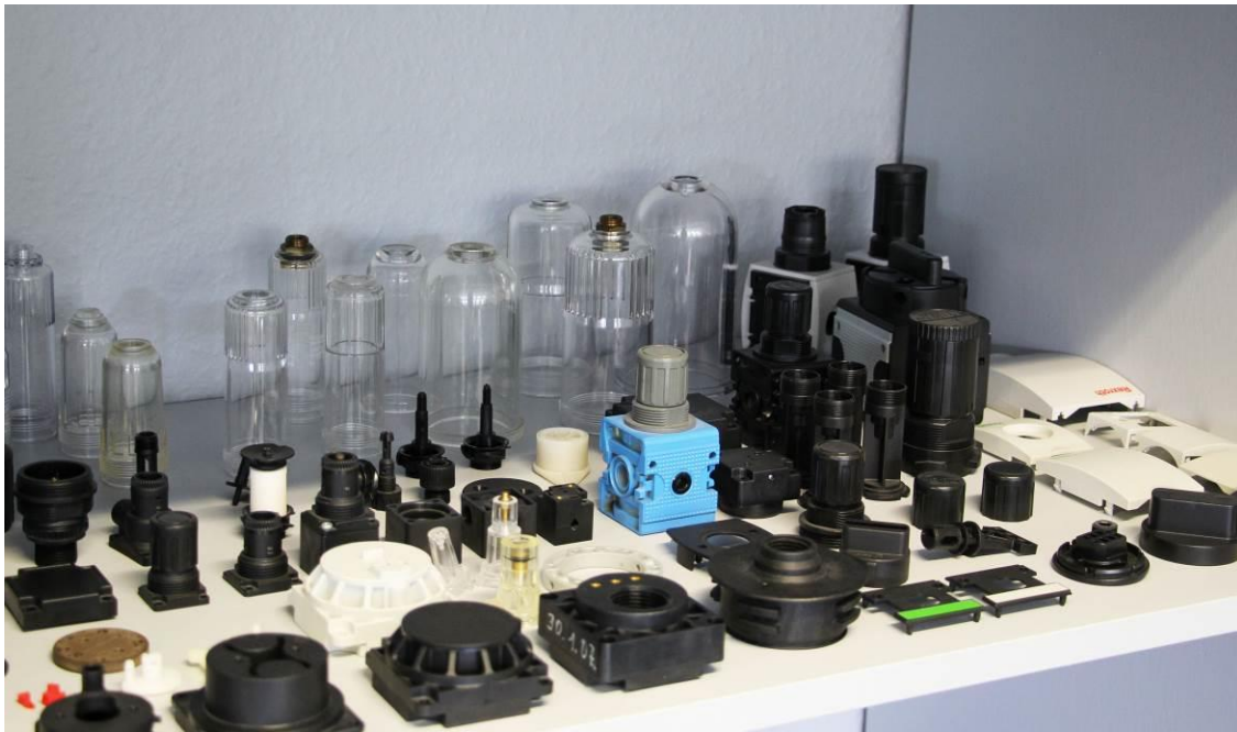
Fig. 7: Typical small parts for general mechanical engineering made by Ackermann