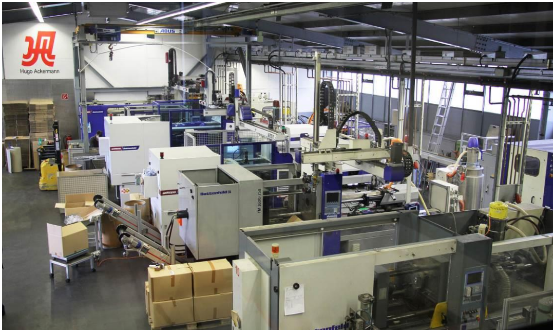
Fig. 1: Ackermann production hall in Kierspe