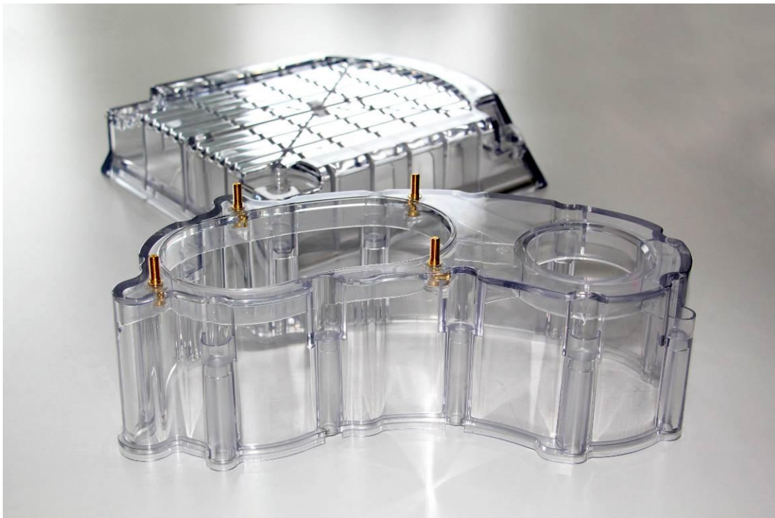
Fig. 6: Housing components made of transparent plastic