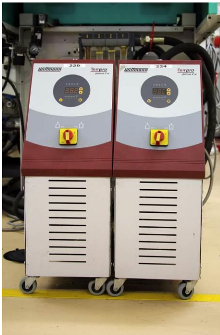
Fig. 5: Temperature controllers from WITTMANN's TEMPRO series