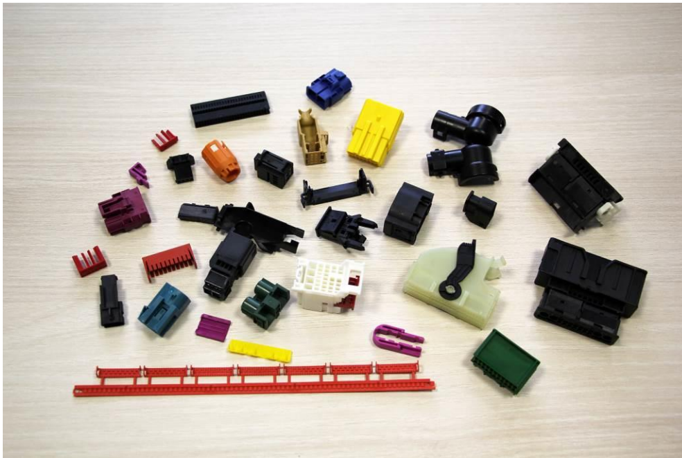
Fig. 6: A selection from the wide range of small parts produced by PWF