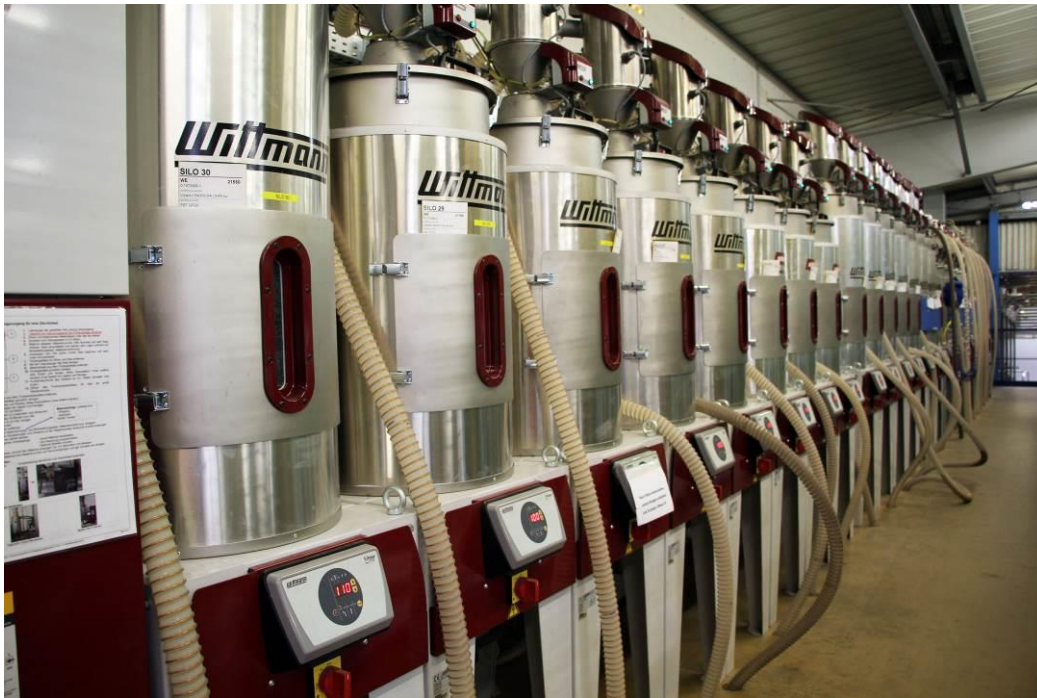
Fig. 4: Central materials handling system from WITTMANN